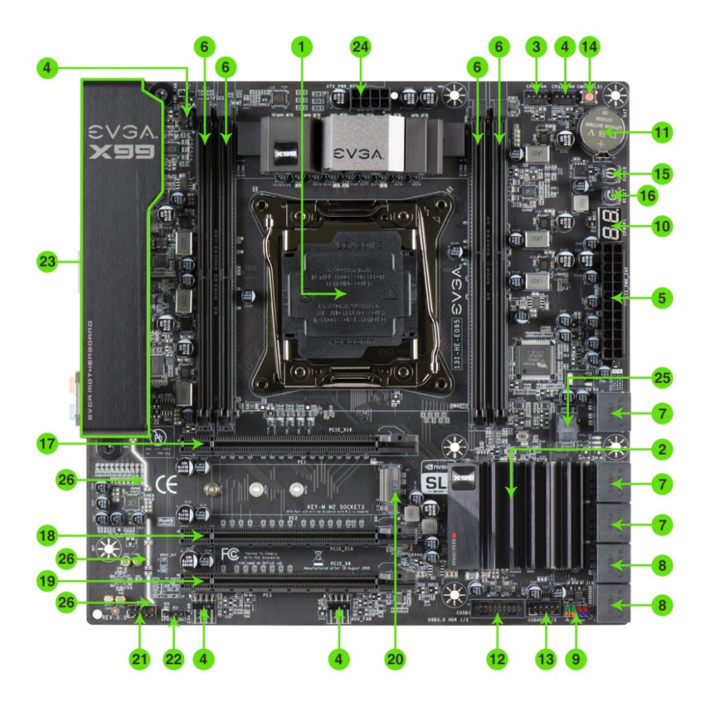
FIGURE 1. X99 Micro2 Motherboard Layout

The EVGA X99 Micro2 Motherboard with the Intel X99 and PCH Chipset and its component breakdown is pictured below. Figure 1 shows the motherboard and Figure 2 shows the back panel connectors